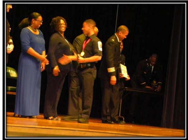
(Pictured) Fire Cadets accepting award