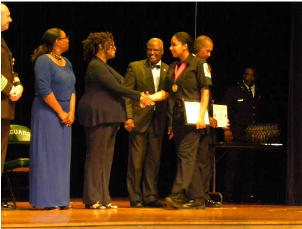
(Pictured) Fire Cadets accepting award