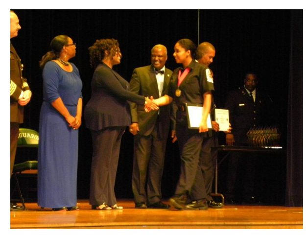
(Pictured) Fire Cadets accepting award