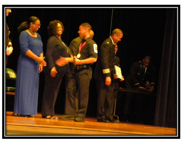
(Pictured) Fire Cadets accepting award