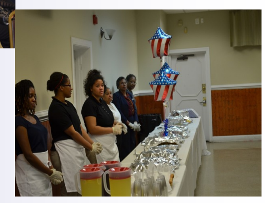
Suitland High School Culinary Arts Students