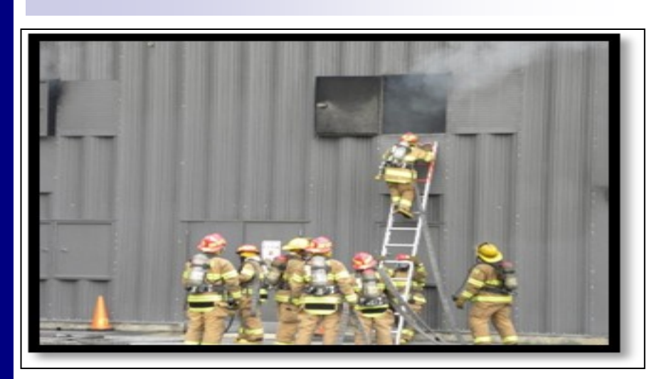
Fire Cadet Training Drills