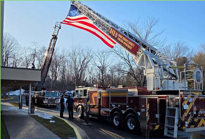
PRINCE GEORGE’S COUNTY FIRE/EMS DEPARTMENT